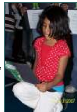
A Veterans Day participant.

For November, our hero is . . . ??? Come to the end-of-month assembly on December 3rd to find out!