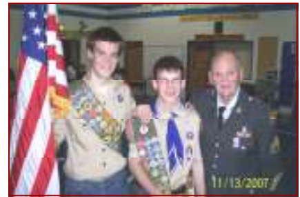
Bridgeport Boy Scout Color Guard

We are continuing to work on building writing readiness.