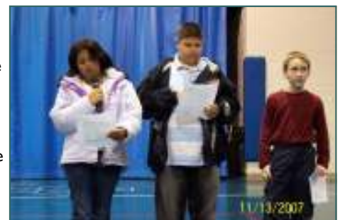
5th graders reading at the Veterans Day assembly.

by dividing them into parts and then reassembling them to create a figure whose area is easier to calculate. We will also use geoboards to study the congruence of shapes. Also we will solve and then pose our own shape riddles. What a fun month in Math!