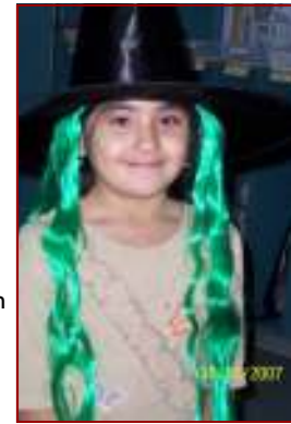
Fun on Crazy Hat Day!

not Fridays. This is to accommodate a schedule change. Students will be sent out the door at 2:15 on Thursdays to a Super Study Time in the lunchroom while teachers collaborate on lesson plans. Third graders will have 30-45 minutes to work on their homework packets here at school before taking them home. The homework packet will actually be due a week later on the following Thursday.