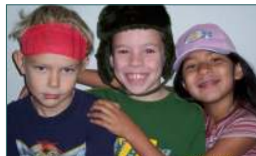
Friends on Crazy Hat Day!

Many classrooms with older students begin with a question of the day, like "What do you like to do