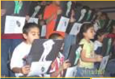
Veterans Day participants

Remember: Winter Break Concerts! K-3 on December 11 (6:30 PM) and 4-6 on December 13 (7:00 PM)