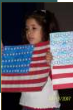
A Veterans Day participant.

If you do not receive a copy of the Mustang Corral , please contact district office at 686-5656.